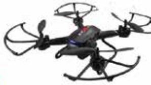
Remote Control Drone