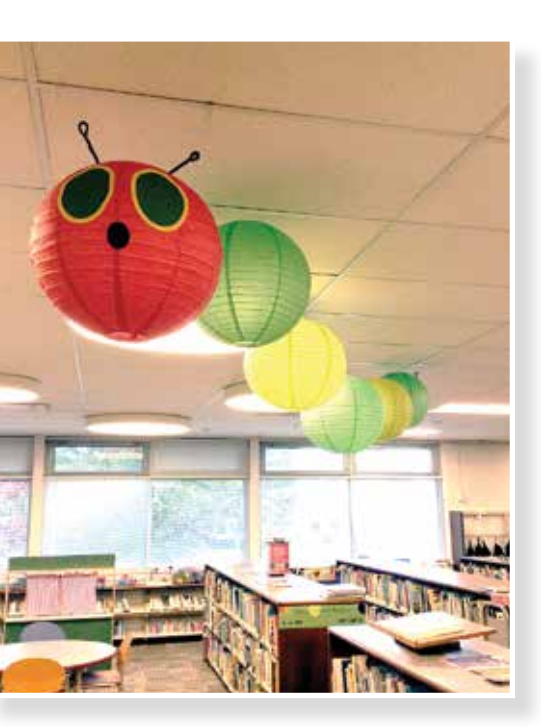
Our new friend in the Children's Area