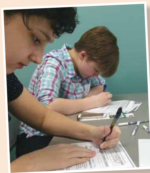
Teens fill out applications at last year's Job Fair

Sunday, April 7, 1-4 pm For ages 15-21. Over twelve local businesses will be looking to hire seasonal and year-round positions such as fast food workers, restaurant servers, lifeguards, cashiers, camp counselors, athletic instructors, swim instructors, tutors, library pages, and more. Information on internships and volunteering opportunities will also be available. No registration required and applicants can come and go but should leave plenty of time to talk with hiring managers and fill out applications. Dress to impress potential employers!