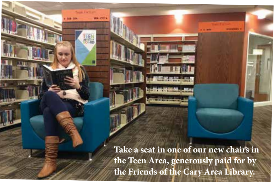
Take a seat in one of our new chairs in the Teen Area, generously paid for by the Friends of the Cary Area Library.