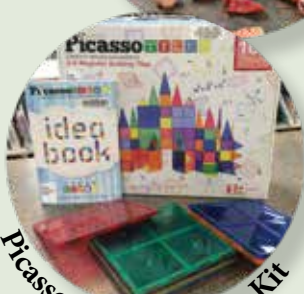
Picasso Magnetic Tiles Kit