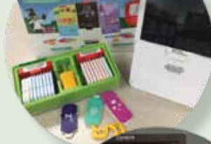
Osmo Coding Starter Kit

As a part of our Library of Things collection (see page 4) we also have a collection of STEM Kits available to CAPL cardholders. This hands-on collection can supplement school learning or allow your child to further explore a topic of interest to them. Items pictured are newly added, but we have Ozobots, Snap Circuit kits, a telescope, an augmented reality globe and much more in the collection. Visit our website for a complete list | caryarealibrary.org/libraryofthings