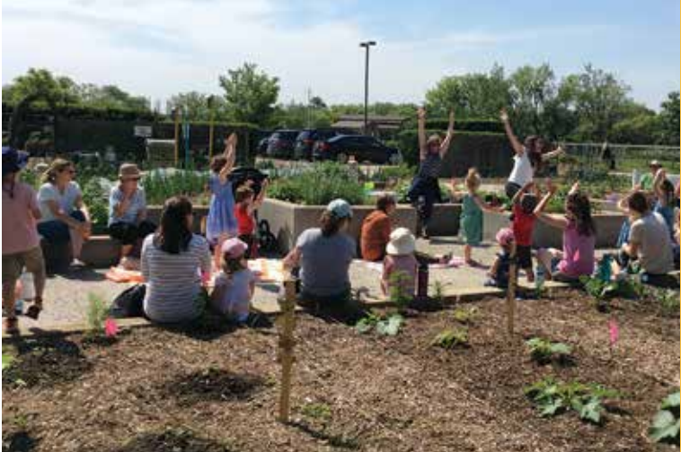
Storytime at Hoffman Park Community Gardens, June 2022

Bilingual Beginnings: Numbers/Números @Home Kit Monday, October 17, kit pickup begins at 1 pm Ages 3-6. Learn English and Spanish words for numbers in this @Home Kit. Participants will be able to check out books about numbers in Spanish and English, and receive a kit with fun activities! Aprende algunos nombres de números en inglés y español con este @Home Kit. ¡Los participantes podrán sacar prestados libros sobre números en inglés y español y recibirán un kit con actividades divertidas!