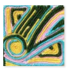
Original artwork by CAPL staff and/or their children