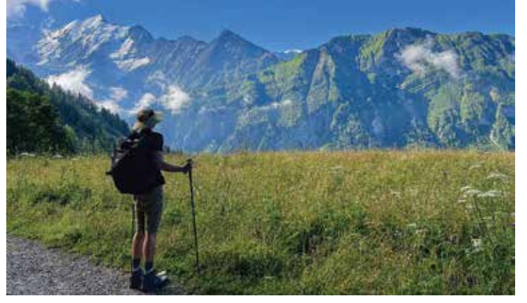
Brian Michalski trekking the Alps

Accessible Metra, Pace and CTA buses and trains are easy to use. Learn about traveling independently, local options, accessibility features, planning an accessible trip, the Reduced Fare and Ride Free programs. A Q&A follows.