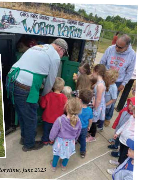
Hoffman Park Gardens Storytime, June 2023