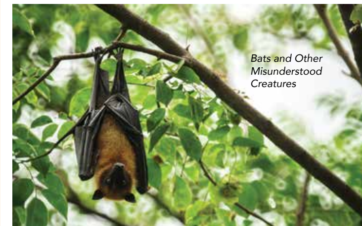
Bats and Other Misunderstood Creatures

Saturday, November 11, 2-3 pm Come as a family to play Turkey Bingo. If you get a bingo, you will win part of your Thanksgiving dinner and, yes, one of the items is the turkey! Register under one name but enter your total group number. Limited to 9 families.