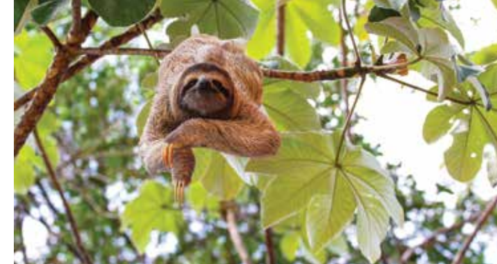
Meet a sloth at the Library during the Mammal and More with Flying Fox Conservation Fund program!