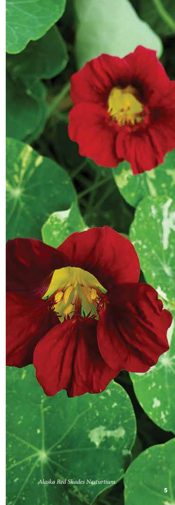
Alaska Red Shades Nasturtium.