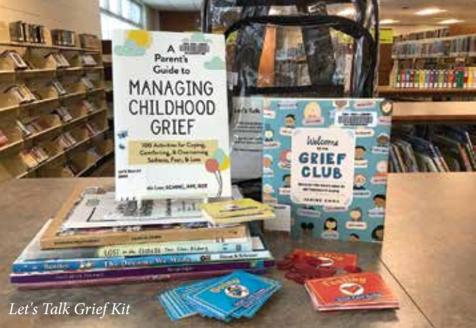
Let's Talk Grief Kit

Free solar eclipse glasses will again be available to patrons beginning March 11 for the total solar eclipse on April 8. One pair per person, while supplies last. If you got a pair from us last fall, those can be reused for this eclipse.