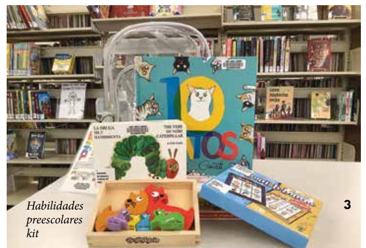
Habilidades preescolares kit

Navega estos artículos y más en nuestra sección de español juvenil nuevamente reubicada que puede encontrar en la parte posterior izquierda de las computadoras públicas para adultos.