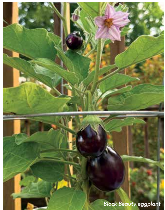
Black Beauty eggplant